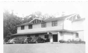
The Riviera Club, 1945

The nightclub business did well during the late 1930s when the old Pavilion in Riverside Park was refurbished and converted into the Riviera nightclub and the Saint Paul House (another nightclub) added a 60x120 ft addition.