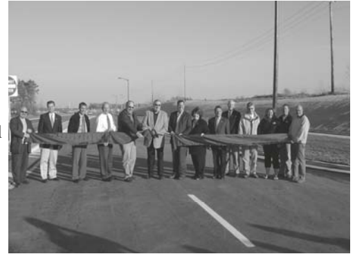
City of Shakopee and Scott County officials open the final segment of 17 th Avenue at CSAH 83.

The 17 th Avenue corridor has been completed in phases, as commercial and residential development occurred in the area. The final segment, the realignment of CSAH 16 with 17 th Avenue, was originally proposed as a study in an update of the 1997 Transportation Plan associated with the city's Comprehensive Plan. In 2001, with the proposed the Dean Lake Business Park and the CSAH 83/CSAH 16 project, the city and county agreed to complete 17 th Avenue to CSAH 83 by 2006. Since the roadway was built as the areas around it were developed, the City was able to assess much of the costs for the road to the various developments, thus saving City and county funds.