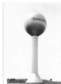
The Shakopee Water tower built in 1937

By 1937, Shakopee was seeing new houses being built, and business improving everywhere as the depression and the drought were becoming a thing of the past. The next year, the City paid the last of its bonds and was completely debt free for the first time in 50 years. At the same time, Saint Francis Hospital, the first public hospital in Shakopee, opened in what used to be the Scott County Poor House. During the next couple of years, Shakopee brought natural gas to the area and installed a new water tower that looked much like a large golf tee. The tower stood 130 feet high and held 150,000 gallons of water—the largest tower of its kind in the world.