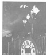
Thomas Dewey visits Shakopee

That same year and for the second time, a Presidential candidate made a whistle stop in Shakopee. On Oct. 15, Thomas E. Dewey, his wife, and his 22 car troop arrived at the train depot to address 2,000 people for a few minutes. After the address they were serenaded by the Shakopee High School band and then left for Saint Paul.