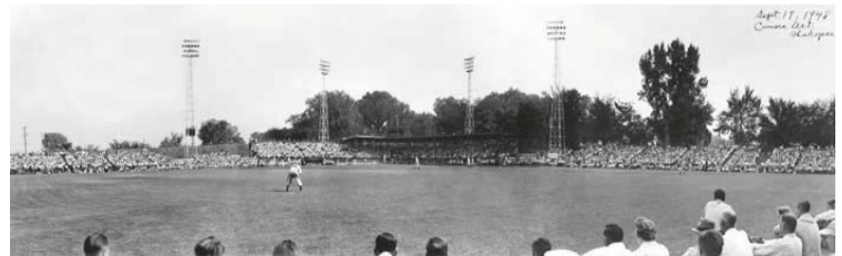
1948 State Baseball Tournament, Riverside Park