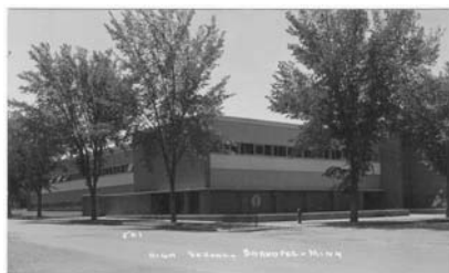
Shakopee High School, 1950