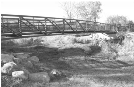
Completed bridge project- Dean Lake Trail.

This project includes enhancements to the Vierling Drive Trail and the Dean Lake Trail. The asphalt on the Vierling Drive Trail was extended 5,000 feet from just west of Ruby Lane to Eagle Creek Boulevard. The area of the Dean Lake Trail from Wakefield Circle was extended 2,200 feet to the west and included the addition of a 90 foot pedestrian bridge over the Prior Lake Outlet Channel. The project was completed in late September, and both trails are open for public use.